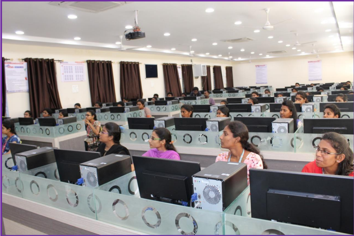
The students participated in programming session

The resource person started with the introduction of Python along with programming and coding techniques. Students were taught about basic syntax of interactive mode, script mode programming and python identifiers, reserved words were explained with some simple examples.