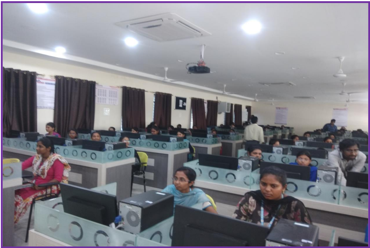
Students during the hands on session

At the end of the course student's asked many doubts regarding the importance of Python programming in projects and placements. The resource person had cleared all doubts. Finally feedbacks were also collected from the students.